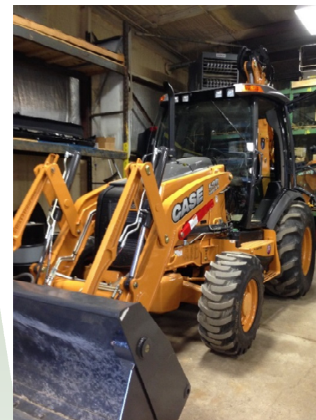
DPW's new backhoe

Failure to shovel your sidewalk will result in the Village having the snow removed AT THE OWNER'S EXPENSE.